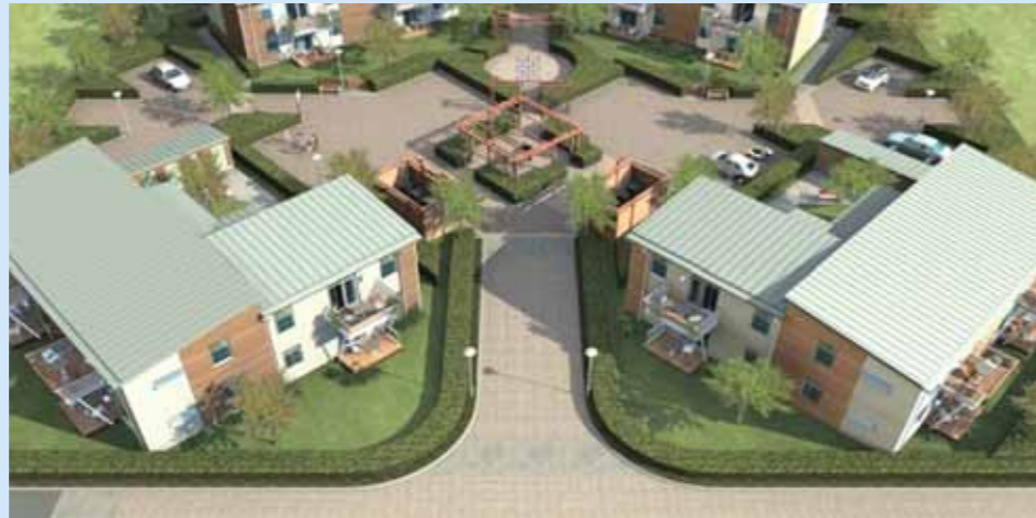
BoKlok scheme announced

• The second Junior Street Wardens scheme was launched with pupils from Canning Street Primary School in Benwell. The scheme involved the young people in their community, teaching them about topics such as recycling and tackling graffiti.