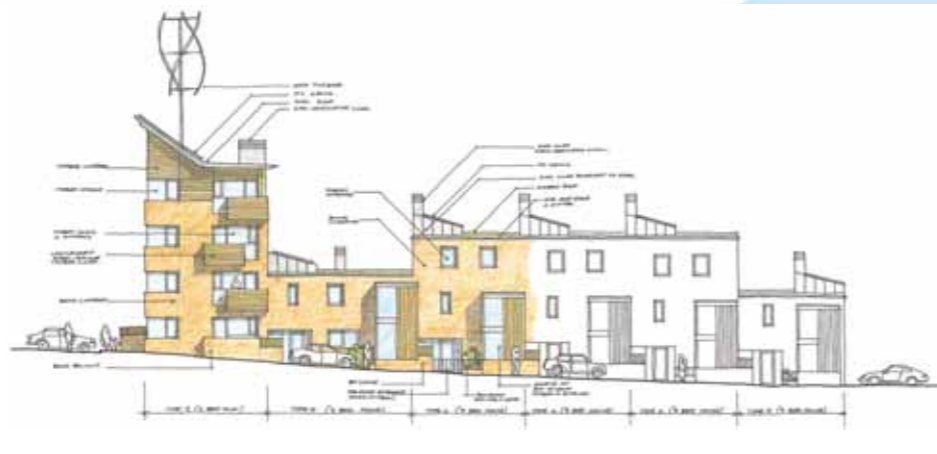
Proposal for St Lawrence Square, Byker