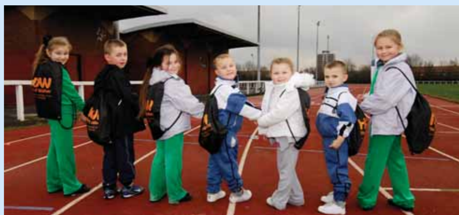
Launch of Heart of Walker Consultation

• The Gateshead Private Landlords Association made renting in Gateshead easier with the launch of their new website www.renting-in-gateshead.co.uk . The website contains helpful advice for private landlords.