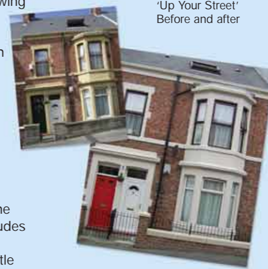
'Up Your Street' Before and after

plans and proposals for property improvements but also other information including keeping the place nice in future. This included their rights and responsibilities as tenants, being a good landlord, home maintenance and energy efficiency, keeping streets/yards clean and tidy, noise control and tackling anti-social behaviour. It is hoped that works can start on site in September 2007.