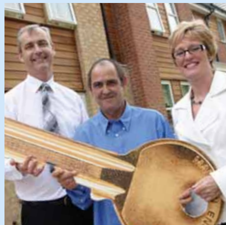
New homes in Walker Riverside

• Residents on the Cambrian estate in Walker moved into the 29 new homes built as part of the multi-million pound Walker Riverside regeneration scheme. A total of 141 new homes are currently being built in the area.