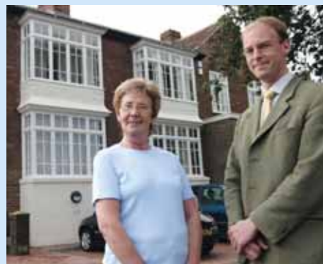
King James Street transformed

• Eight flats on King James Street in Gateshead were transformed, benefiting from new kitchen and bathroom fittings as well as central heating systems and new roofs.