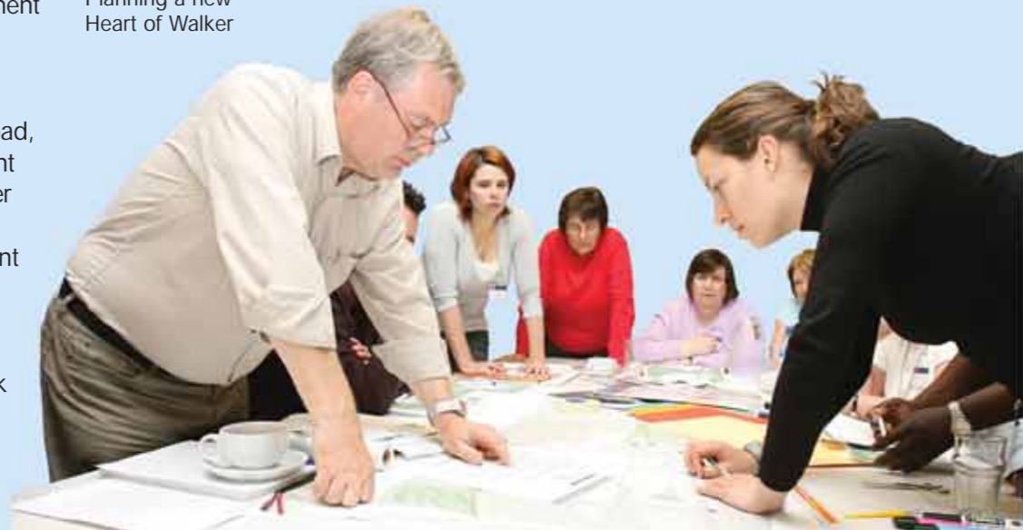
Planning a new Heart of Walker

This year Benwell Neighbourhood Management Initiative organised two weeks of clean up activities , one for North Benwell Terraces, Gill Street and the Courts and another for High Cross. The programme of activities built up pride in the area and included daily litter picking, junior warden activities and a residents' coffee morning. The first week ended with a fete in Ladykirk Community Garden. Everyone joined in the activities including a dedicated group of volunteer residents, Newcastle City Council, Bridging NewcastleGateshead, Your Homes Newcastle, Home, Newcastle Private Rented Project and Northumbria Police.